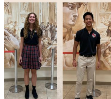
High School (9-12)