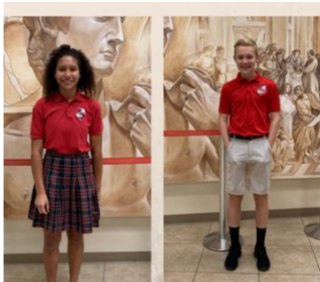
Middle School (6-8)